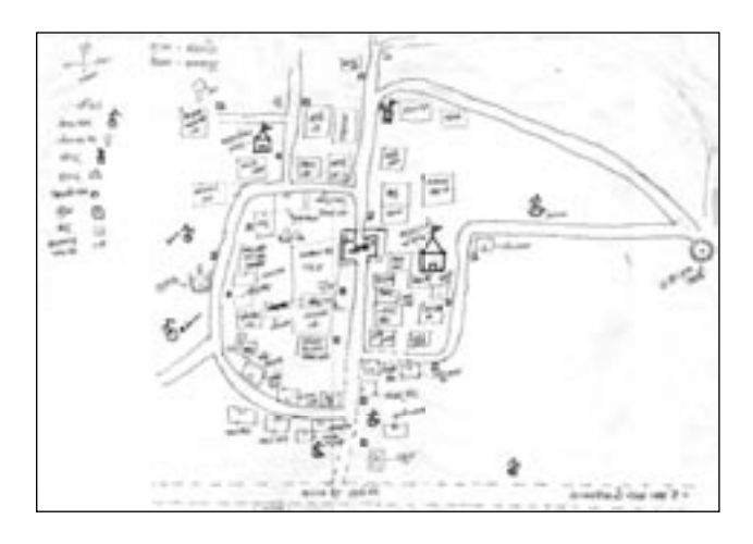
PRA Map of Village Samri showing location of Water sources

The perenniality of surface water sources (rivers/ rivulets/ponds) is under sustained pressure of providing increasing amounts of water for irrigation converting erstwhile perennial water sources into seasonal sources. The ground water sources too face competition for irrigation and in the absence of recharging structures they either become dead or