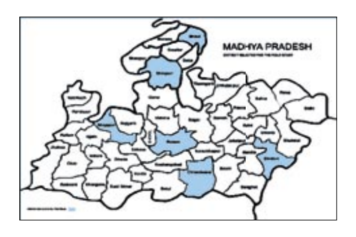
Map 1 Districts Selected for the Study