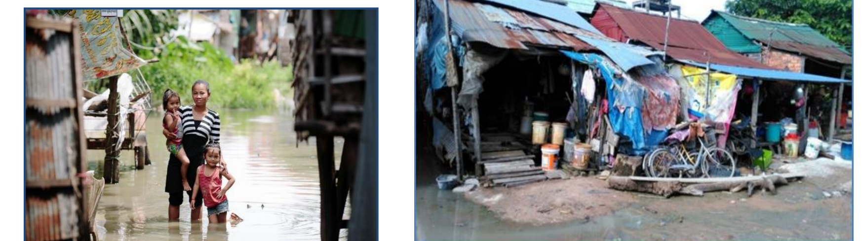
Figures 3 & 4: Residents in Chong Koasou; Typical home in Siem Reap's informal settlements

In all neighborhoods, produce was a dominant exposure pathway for both adults and children, with all survey respondents ingesting >10 4 colony forming units (CFU) of E. coli per month. Bottled water was the primary drinking water source for most respondents in both formal and informal neighborhoods resulting in high levels of exposure to fecal contamination from this pathway (ranging from 10 3 CFU to 10 5 CFU of E. coli per month). Over 80% of adults and children reported contact with floodwater during the rainy season; floodwater was a dominant pathway for adults and children in Veal/Trapangses (formal) and for children in Kumruthemey (formal). Well water was reported as a source of drinking water for ≤ 65% of all respondents with highest frequency of exposure in Veal/Trapangses (formal). This study did not find land tenure status to have an impact on risk of exposure to fecal contamination.