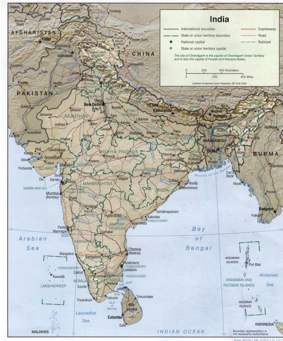
Figure 1. Relief map of India (courtesy of The General Libraries, The University of Texas at Austin).

The terrain ranges from the extremes of the