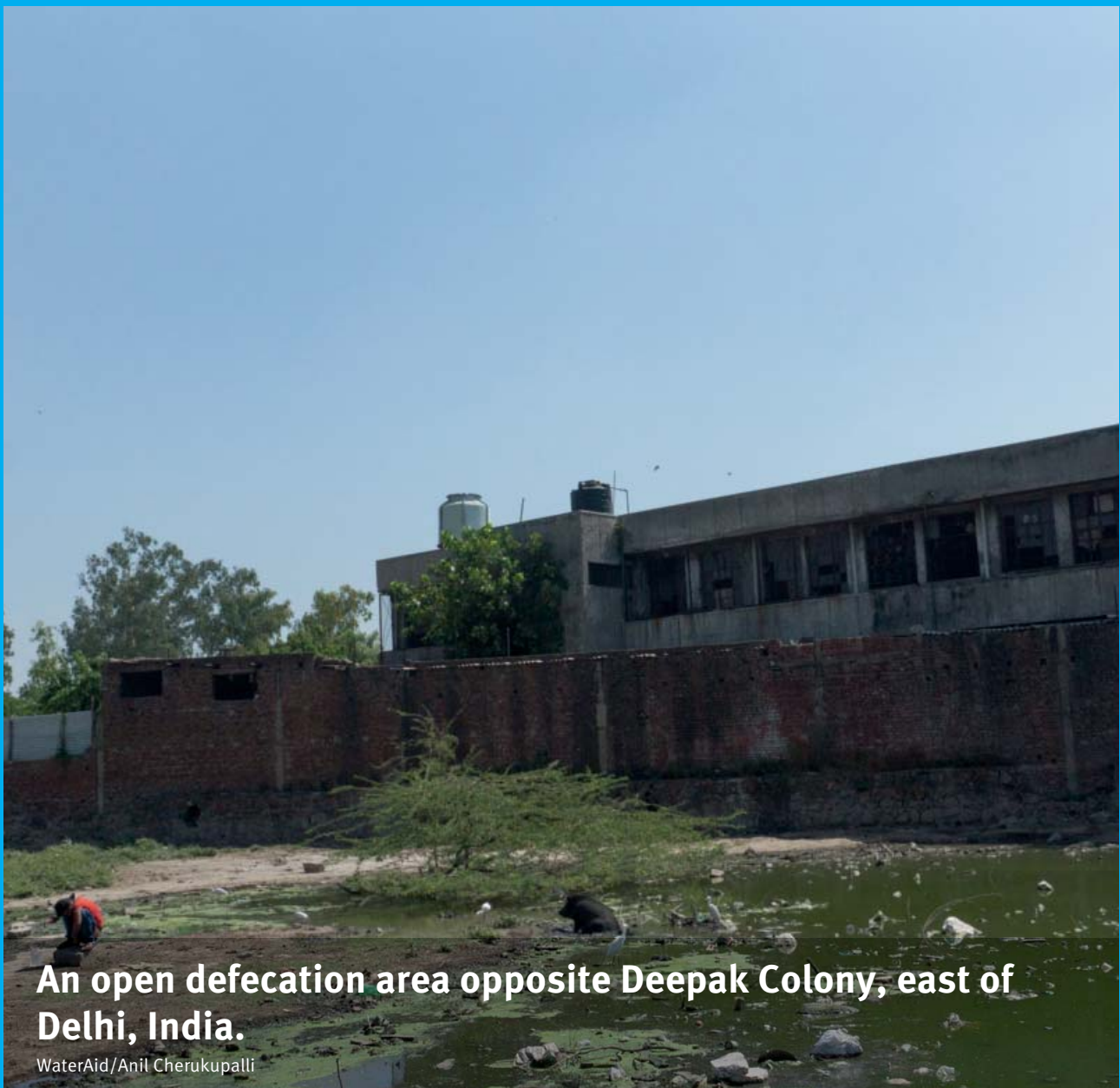
An open defecation area opposite Deepak Colony, east of Delhi, India.

If Clean India is to succeed, sanitation must be seen as a fundamental human right along with food, education, livelihoods and health, for everyone in the country – including the poorest and most marginalised.