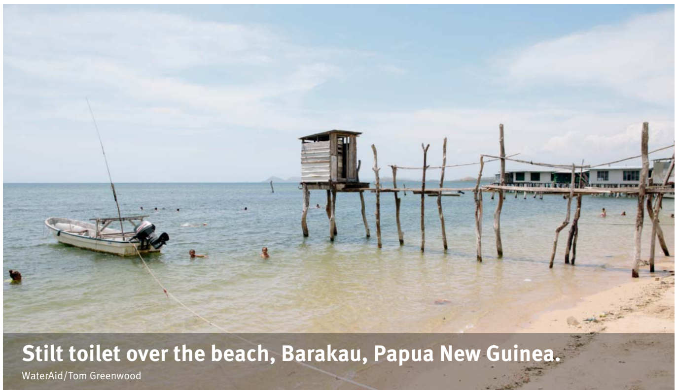
Stilt toilet over the beach, Barakau, Papua New Guinea.

Finally, we include a mention for Papua New Guinea , which is the only state outside Sub-Saharan Africa to fall in the world's hardest 12 countries in which to find a toilet, by percentage of population. Some 81% of this Pacific island's residents do not have a safe, private toilet to use. With an average per-person gross national income of $2,030, a child mortality rate of 61 per 1,000 livebirths and a life expectancy of 62 years, life for people here is incredibly difficult. On average 220 women out of every 100,000 will die in childbirth, and at least one in 20 of those will die of sepsis which might have been prevented by safe water, good sanitation and rigorous hygiene, including by the midwife washing their hands with soap.