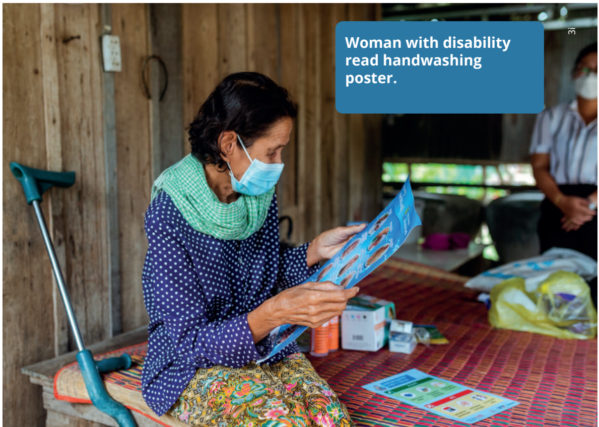
Woman with disability read handwashing poster.

A key strength of this study was that people with disabilities were core research team members who collected data. The in-country data collection team was made up of professionals with experience across qualitative research methods, WASH and disability sectors. Another strength was the diversity of the range of key informants interviewed. The study captured perspectives of a diverse population across district and national settings, women and men with a range of impairments participated, and their caregivers.