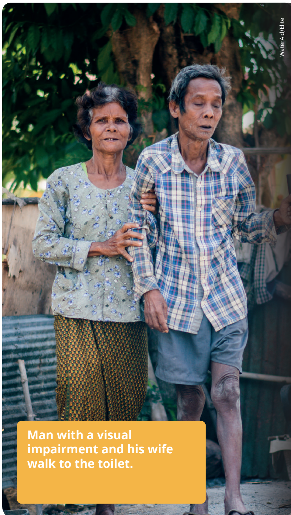
Man with a visual impairment and his wife walk to the toilet.