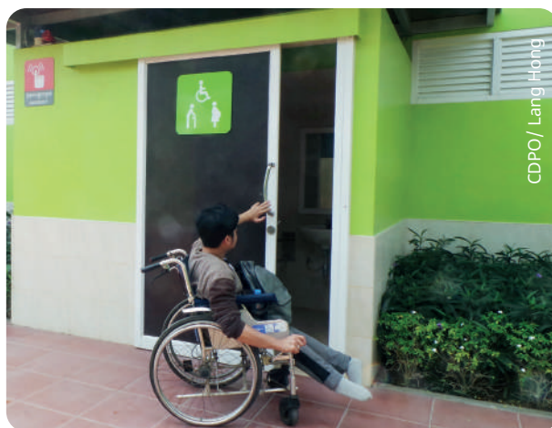
Man using a wheelchair uses accessible toilet at a shop.

Participant: No, where can I get the money for that when I do not have any money?