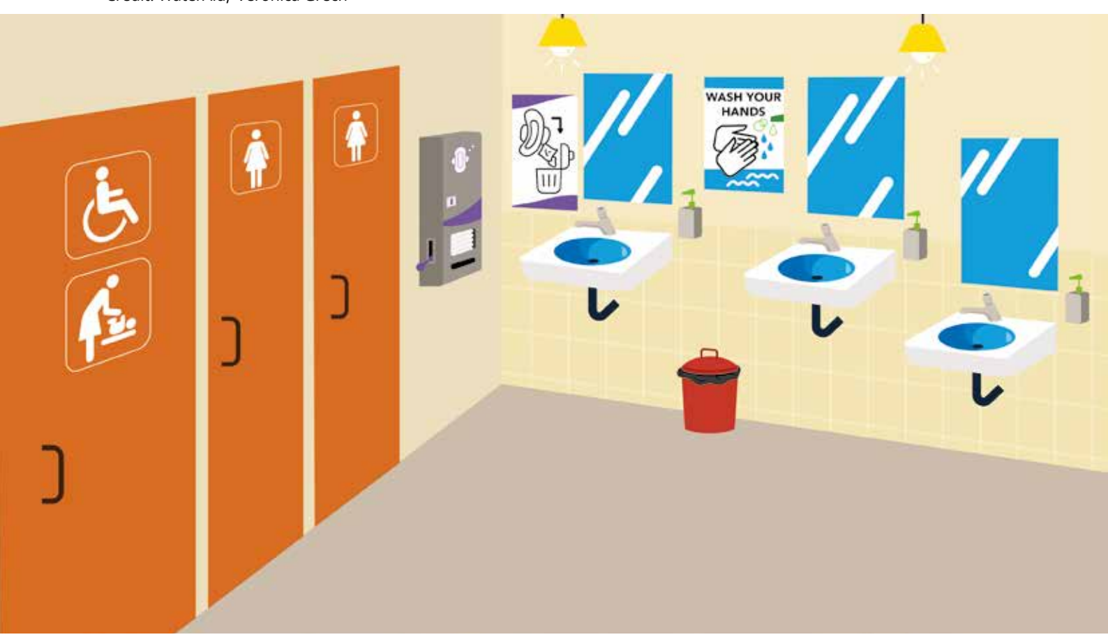
Figure 2: An example of the interior of a female-friendly toilet block.