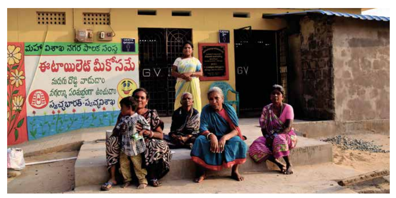
Public toilet in Visakhapatnam, India.

The city government used conclusions from this evaluation to design and set up sanitation facilities for women in Warangal, including four women-only toilets.