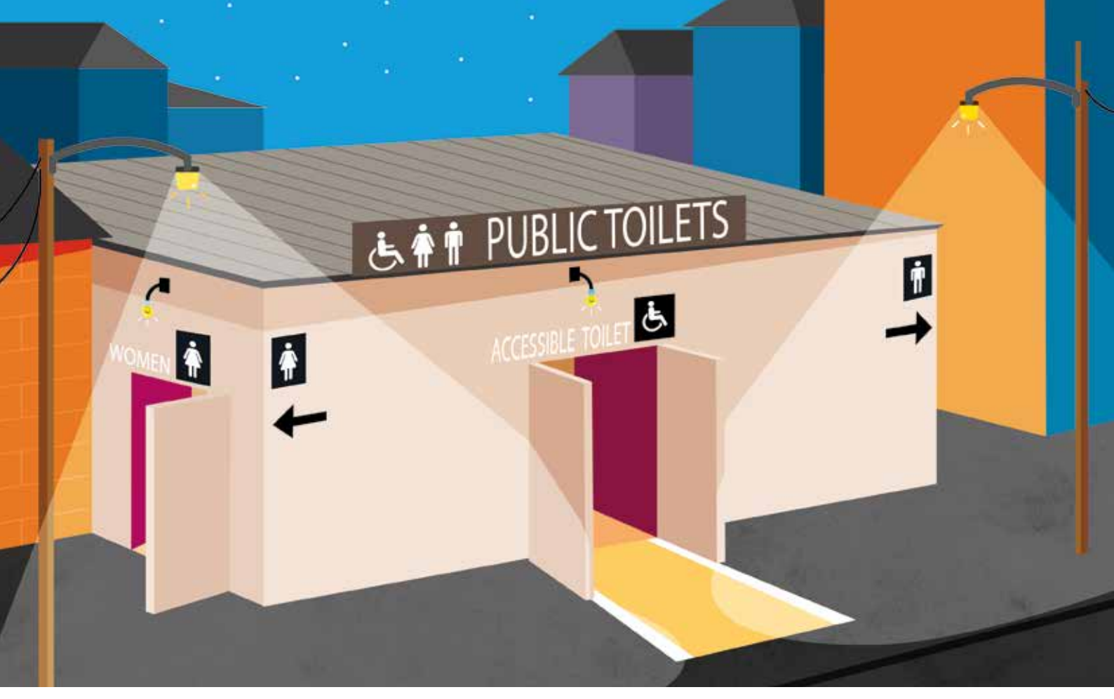
Figure 1: An example of the exterior of a female-friendly toilet block.