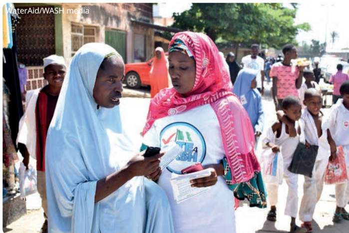
▲ Engaging the public during the Vote4WASH campaign rally in Bauchi State.

Continued pressure on elected politicians from the public and civil society organisations has resulted in 122 new and improved water facilities across five constituencies.