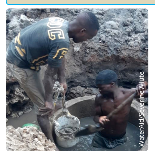
A sanitation worker diving into the pit during toilet upgrading.

WaterAid Tanzania commissioned an assessment with the aim to (i) identify occupational hazards associated to sanitation work and risk mitigation measures, (ii) understand the relevant institutional arrangement, regulation, and organizational structures and (iii) formulate recommendations and next steps to overcome identified challenges. The assessment included a literature review and nineteen interviews with sanitation workers, local governments, and regulatory authorities.